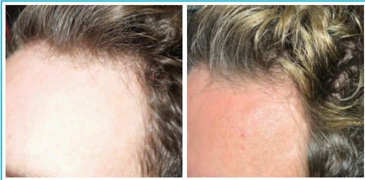
Before and after microneedling treatment with post-treatment application of BENEV Exosome Regenerative Complex

The Elastic Line of threads are manufactured via unique methods to provide a high polymer double coating. The exclusive FCV cannula tip is carefully positioned to reduce resistance from the fixing anchor