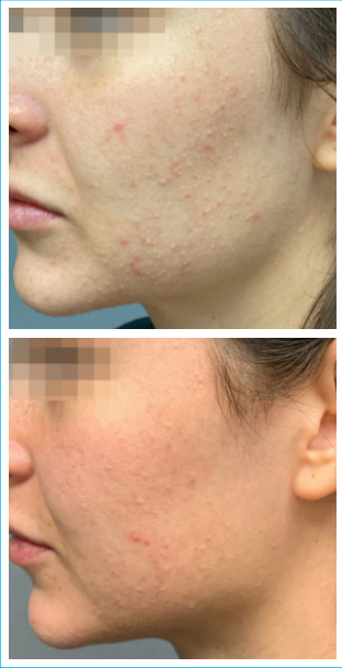
Before and after treatment of acne and pigmentation with Sylfirm X Ultimate Edition and post-treatment application of BENEV Exosome Regenerative Complex

across the entire field of medicine are staggering.”