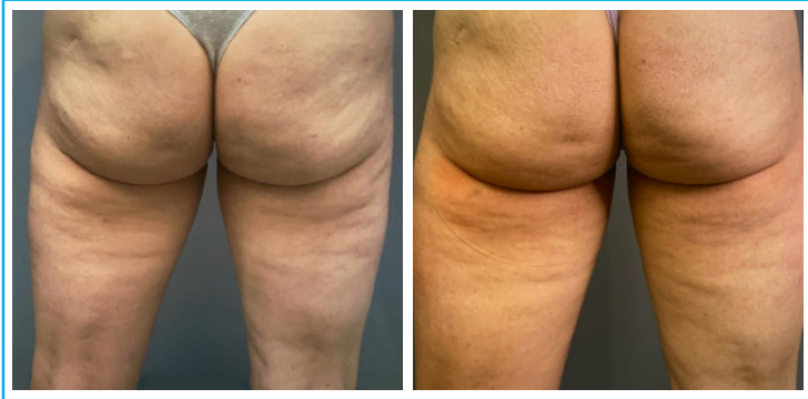
Before and after treatment with Sylfirm X Ultimate Edition to tighten and lift the buttocks

varying needle insertion depth and conduction time in both cases. Tissue reactions in and around thermally induced coagulation columns were carefully noted via histologic examination.