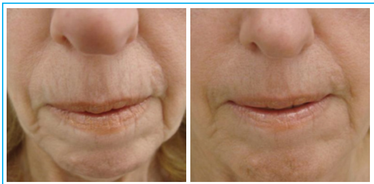
Before and after treatment with Syllfirm X Ultimate Edition to firm and lift the face

While PRP will remain useful for quite some time, Dr. Jin discussed just how powerful exosomes are, stimulating the regenerative cascade while minimizing inflammation. “BENEV Exosome Regenerative Complex + delivers a variety of more than 50 active components, including growth factors, directly to cells in the treatment area using the very mechanisms of natural intercellular communication. This makes BENEV Exosome Regenerative Complex + the ultimate addition to the regenerative aesthetics armamentarium by itself or as supplementation to any therapy. The potential applications